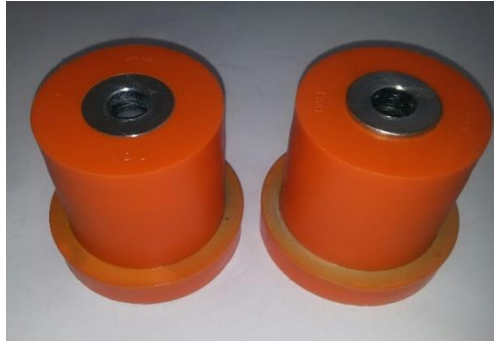
2x 1BU Polyurethane Pieces and 2x 1BH Tubes

The bush should be fitted on the wishbone such as the flange faces the rear of the car.